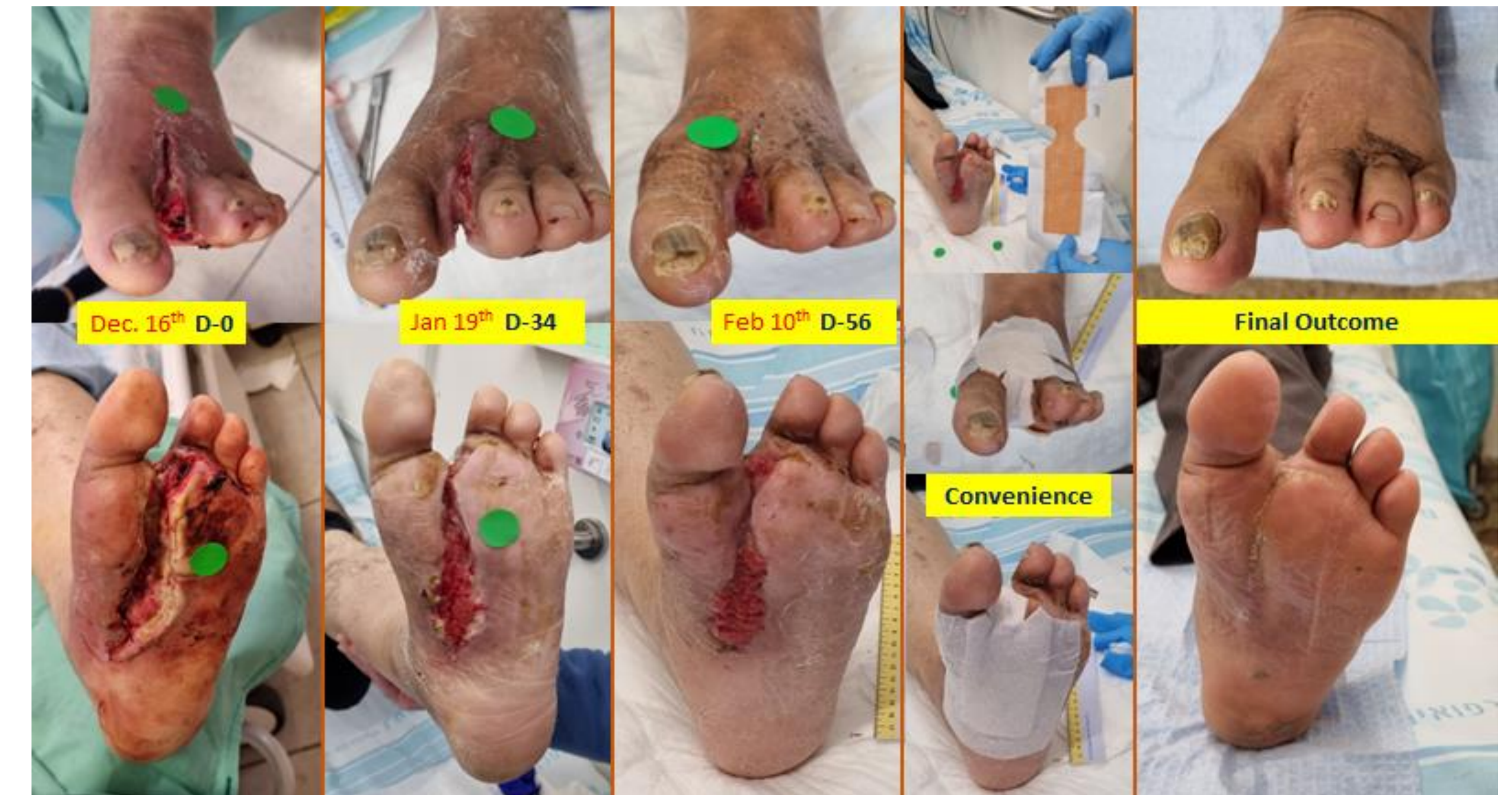
Patient No. 10. - COD Arm