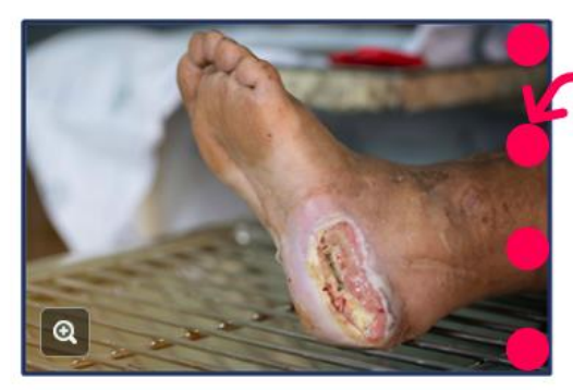
ssive exudate, improper sings used, infrequent essings changes or a nbination of all the above