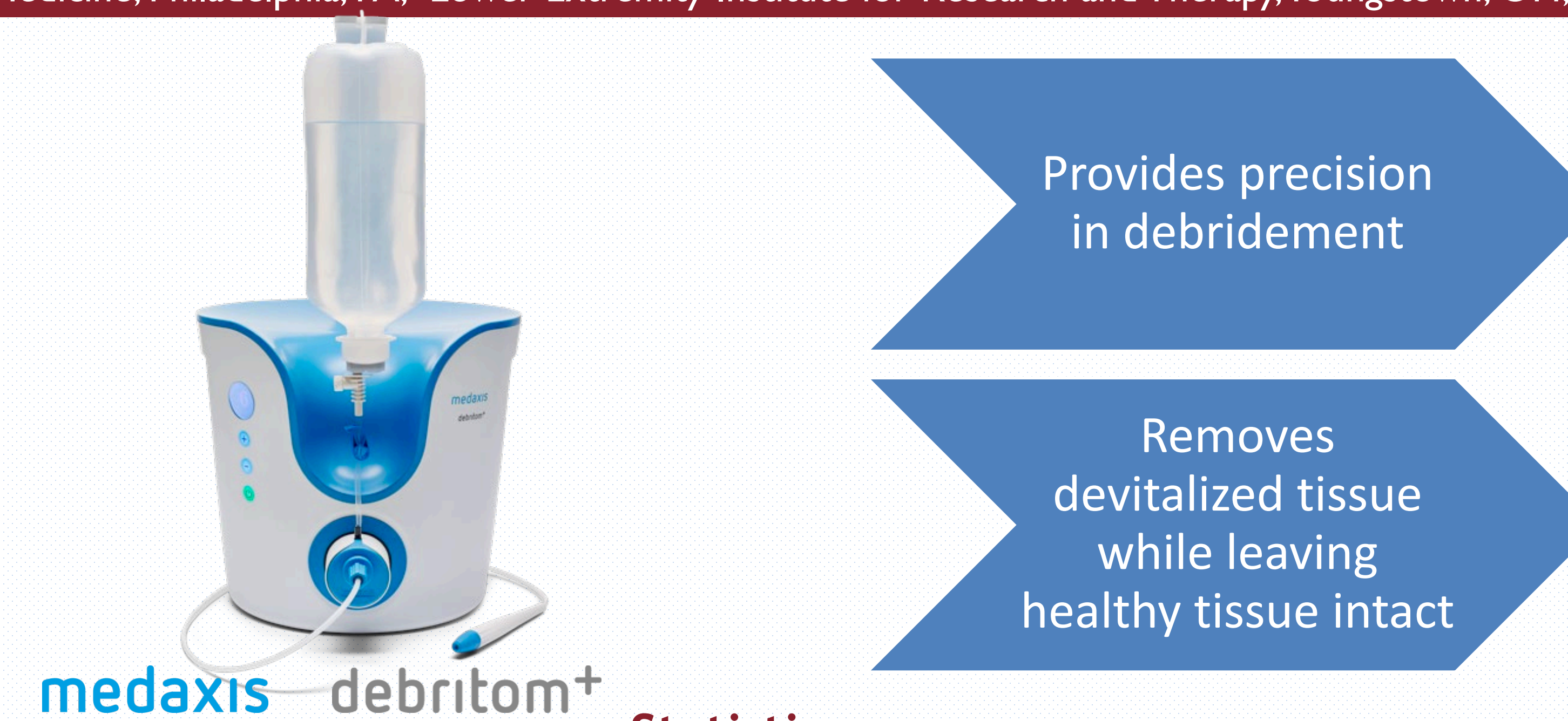
medaxis debritor+ Statistics Percent wound area reduction