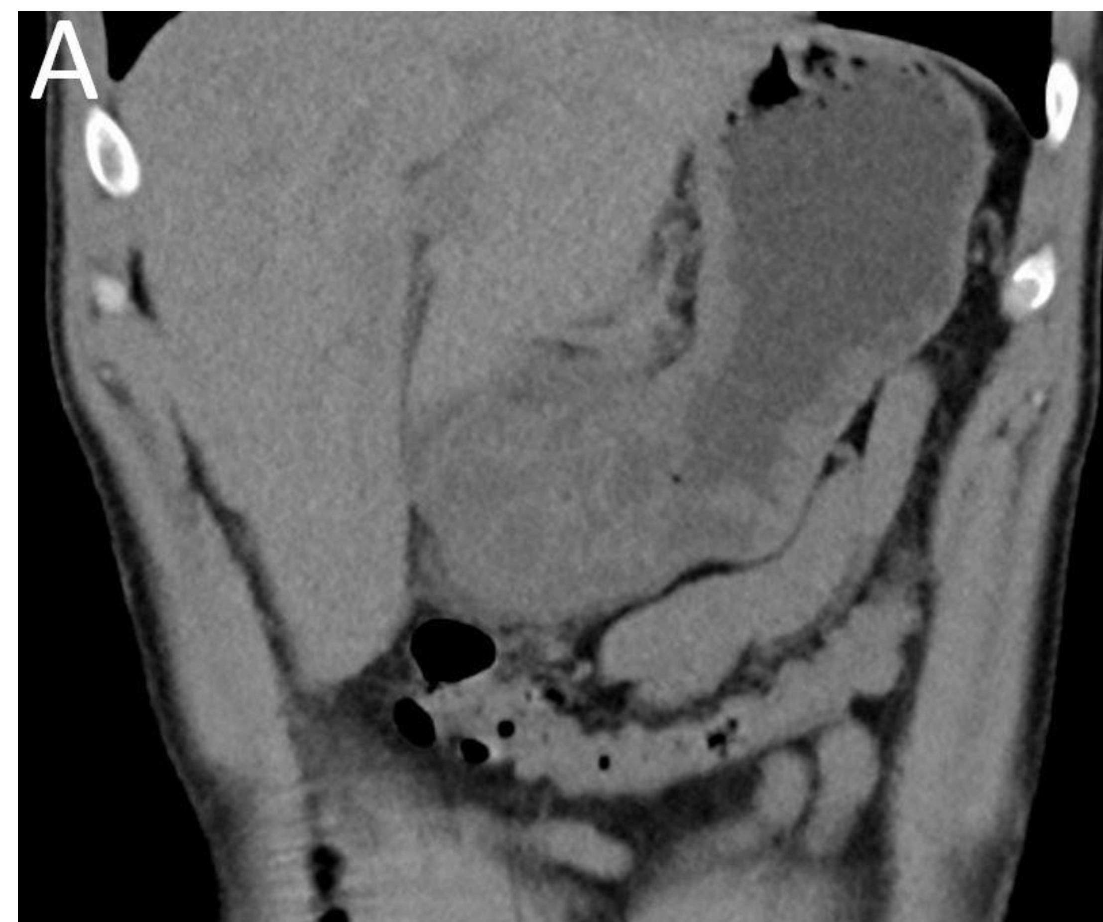
Figure 1A: CT scan of the abdomen without intravenous contrast demonstrating gastric antral thickening and mild associated inflammatory stranding

The patient then underwent an EGD which demonstrated a single swollen/edematous appearing 25 mm submucosal papule (nodule) with central umbilication in the gastric antrum endoscopically consistent with a pancreas rest (Figure 1b).