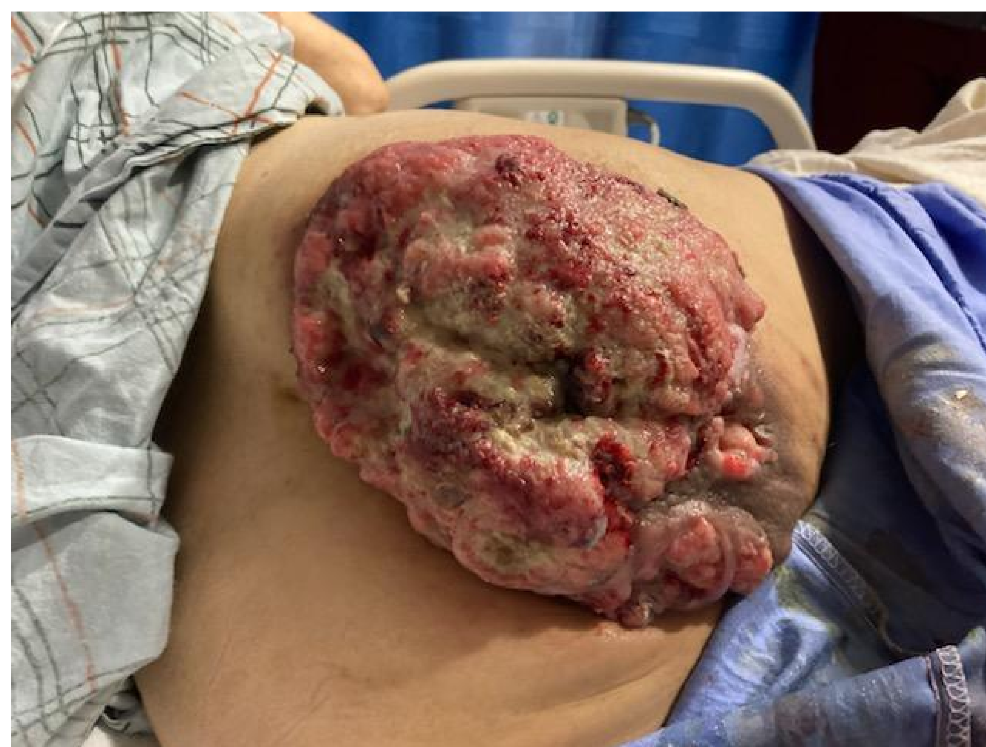
Figure 1. Fungating Gluteal mass

A 74 year old Hispanic male with history of Crohn's disease with recurrent perianal fistulas and abscesses, COPD and alcohol dependence presented to the ED after a mechanical fall. He also reported a right gluteal lesion associated with pain and serous discharge for the past two years, which had been increasing in size. On physical exam, he was cachectic and had a foul-smelling fungating, friable mass with overlying granular tissue and serosanguinous drainage ( figure 1 ) and palpable bilateral inguinal adenopathy. Laboratory tests revealed leukocytosis with a white count of 15.2K/uL, Hgb 5.5g/dl, MCV 65.5FL, PLT 546K/uL. A Sodium 124mmol/L, Lactic acid 1.2mmol/L and tumor marker workup revealed a CEA 713.6ng/mL and CA 19-9 8.1U/mL. An MRI of the pelvis revealed a 9.8 x 16.1 x 7.7cm heterogenous mass inseparable from the posterior aspect of the anus and along the course of a previously seen perianal fistula ( figure 2 ), bilateral inguinal and external iliac lymphadenopathy and multiple pulmonary nodules. Colonoscopy revealed neither colonic mass or fistula track.