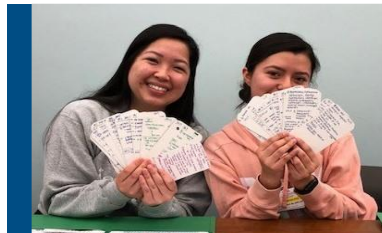
Guided reflection & note taking are encouraged