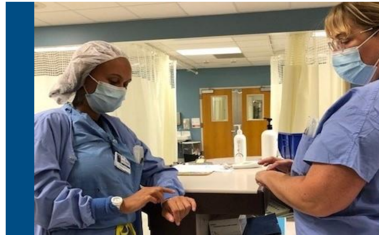
Students learn IV starts, & interact with patients & family in pre-op

1 Nursing, Kaiser Permanente Northern California, Oakland, CA • 2 Regional Offices, Kaiser Permanente Northern California, Oakland, CA • 3 Patient Care Services, Kaiser Permanente Northern California, Oakland, CA