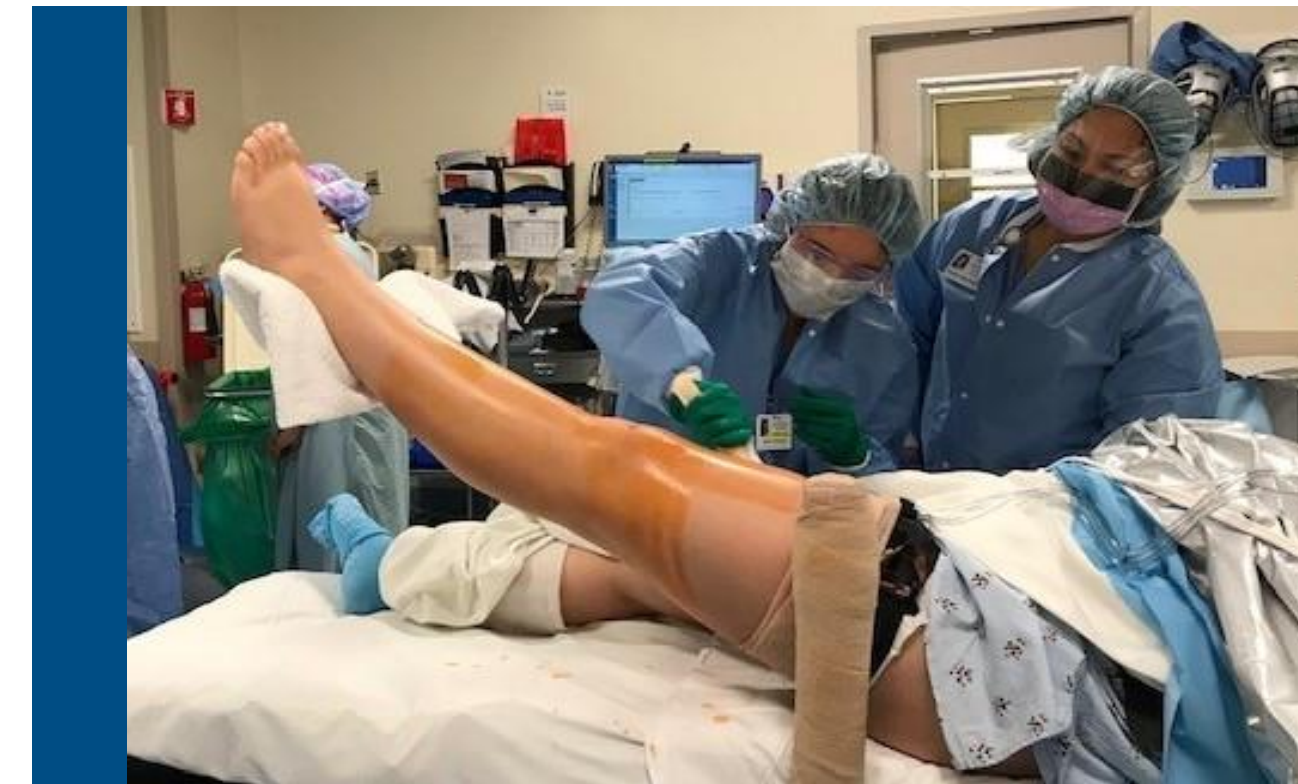
Students provide direct patient care after skill acquisition in a sim lab