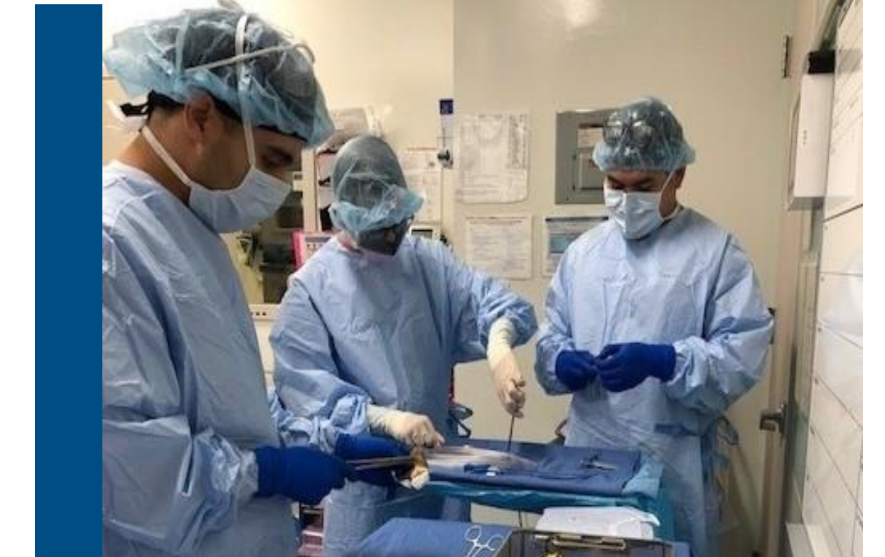
Students are provided AORN study guides to augment learning