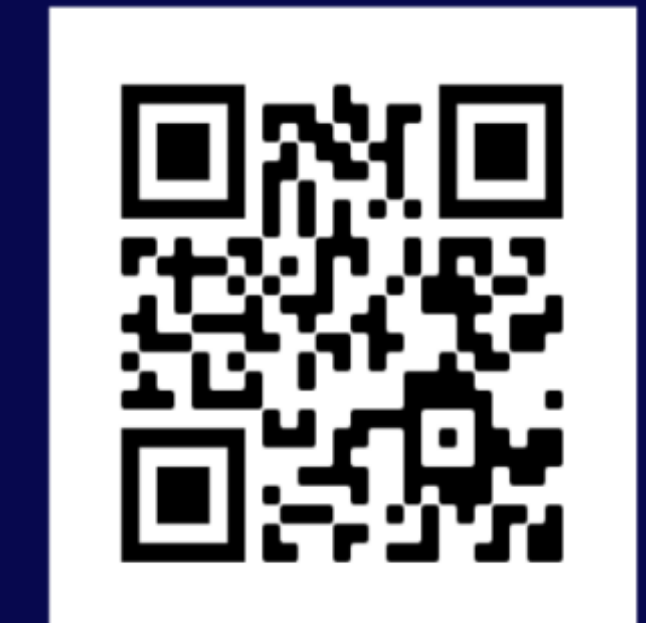
Point of Use/ Removal of Gross Soil Compliance

Scan QR Code Below to view NHCP Point of Use Decontamination Process Video