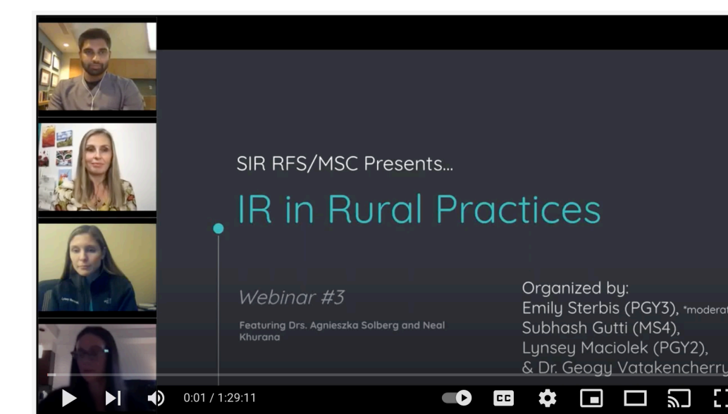
SIR-RFS Webinar: IR Practice Types Part 3: Rural IR (10/18/21) 73 views • Nov 2, 2021