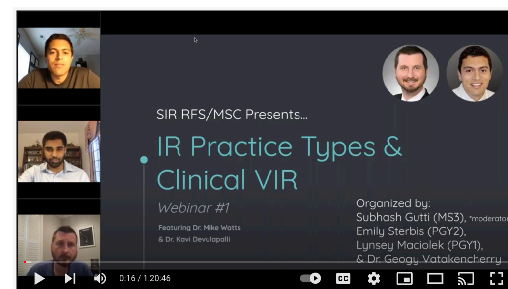
SIR-RFS Webinar 6/24/21: Introduction to IR Practice Types 564 views • Jun 29, 2021